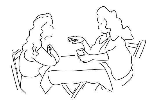
Figure 1: The setting of a coffee cup fortune-telling session

This study used naturalistic fortune telling sessions as the design. Turkish fortune telling sessions provide a viable setting to assess temporal information. In Turkey, coffee fortune-telling is a widespread practice interwoven in daily life and considered by most people as an occasion for creating social interaction. Moreover, Turkish coffee drinking and fortune telling sessions create an enjoyable, warm and sometimes humorous social environment. In Turkish culture, it is very common for people to tell others' fortune by examining the coffee cup after drinking coffee. Both the fortuneteller and the listener (the person who drank the coffee) are engaged and attentive in this interaction (see Figure 1). The fortunetellers' narratives involve rich verbal and non-verbal information. Furthermore, the contents of fortune telling involve the past, present and future of the fortune receivers' lives, which provide abundant natural temporal data to be examined. That is, fortune telling is a good setting for us to examine temporal speech and gesture interaction.