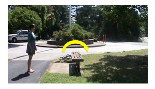
Figure 1: Sample stimuli from the experimental task. The picture is a still frame from the movie clip of a motion event: jump over. The yellow arrows indicate the direction of the movement.

Participants watched 20 dynamic movie clips, depicting different motion events with randomized combinations of 10 manners (hop, skip, walk, run, cartwheel, crawl, jump, twirl, march, step) and 9 paths (through, to, out of, under, over, in front of, around, across, into). The actions were performed by a woman in an outdoor area (see Figure 1 for sample stimuli).